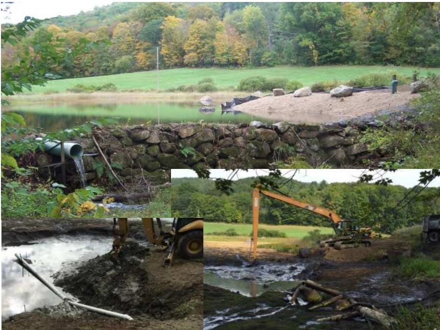
Dredged Fire Pond & New Dry Hydrant in Weathersfield